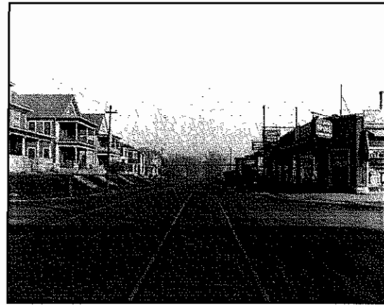
Fourth Avenue South at Twenty-sixth Street, 1930-1939

The proposal to redevelop the Nicollet-Lake area with a large shopping center featuring an enclosed courtyard was a long and controversial process. Initially proposed in 1972 as a way to address the issues of vacant stores and declining revenues in the vicinity, the shopping center was viewed with skepticism by local business owners and residents who feared that viable shops and houses would be displaced. The initial developer, Nicollet-Lake Associates, was dismissed by the city council in 1976 after missing several deadlines. Waiting in the wings was another developer with a SuperValu grocery and a